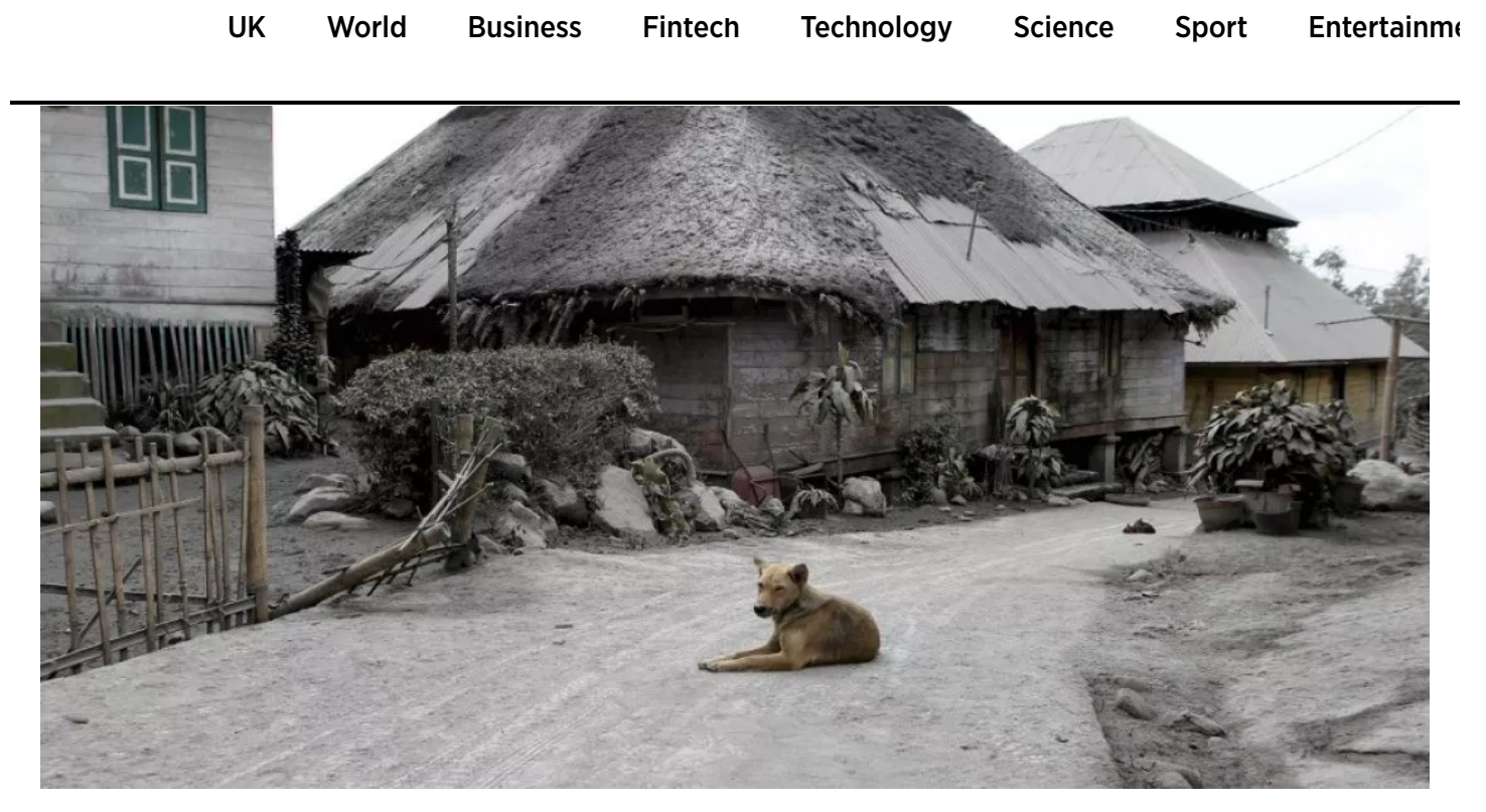
Over 6,000 people have fled nearby villages

According to Indonesia's Antara news agency, the government has raised the alert level to Level 3, the second highest alert on the country's scale. Residents are advised to abandon areas within a three kilometre radius of the volcano.