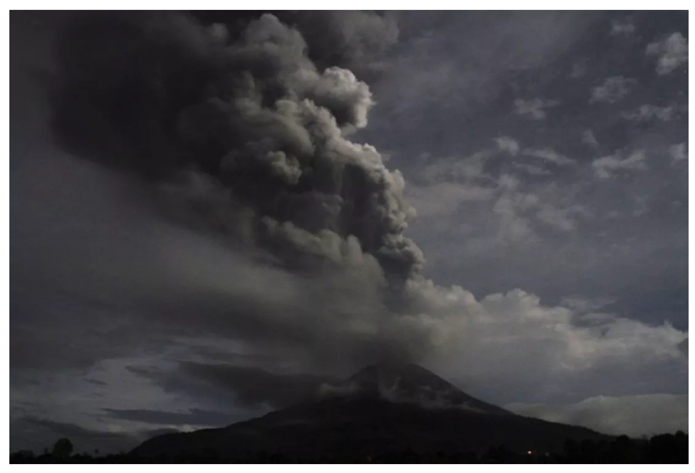
Mount Sinabung records biggest eruption