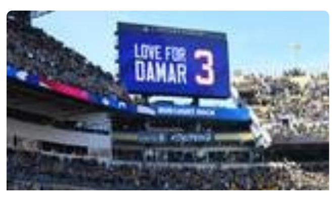
Fans denounce Steelers' behavior after apparent mock...