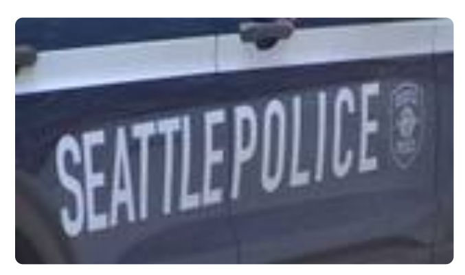
Seattle police arrest man after he's seen loading...