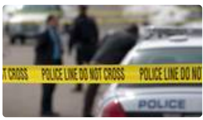
Body found in storage container on porch of home