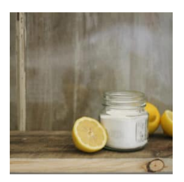
Top 10 Essential Oil Cleaning Recipes (https://www.theprairiehomeste ad.com/2016/04/essential-oilcleaning-recipes.html)