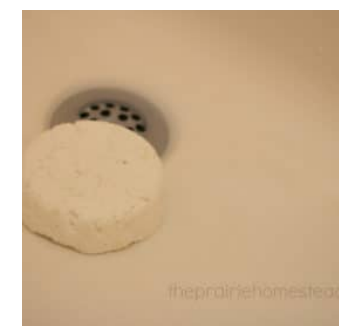
The Coolest Homemade Tub & Shower Cleaner EVER: The DIY Scum Buster Bar (https://www.theprairiehomeste ad.com/2013/09/the-coolesthomemade-tub-shower-cleanerever-the-diy-scum-busterbar.html)