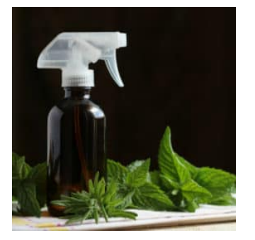
10 Best Homemade Air Freshener Recipes (https://www.theprairiehomeste ad.com/2013/06/homemadeair-fresheners.html)