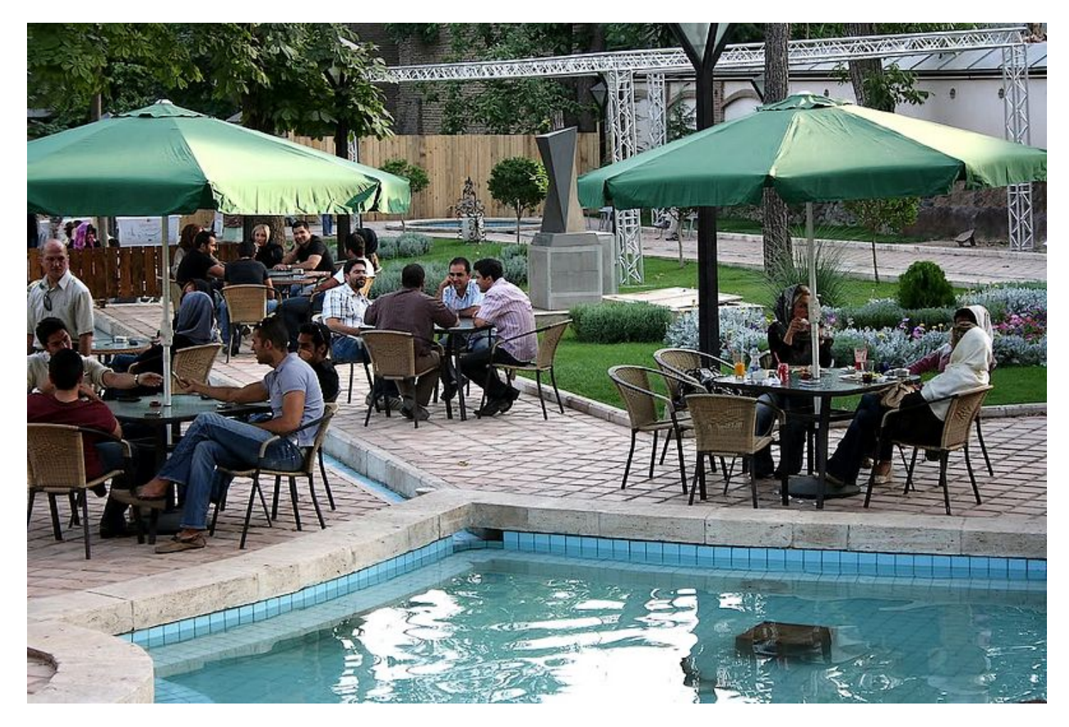
Here are the "tents" they live in.