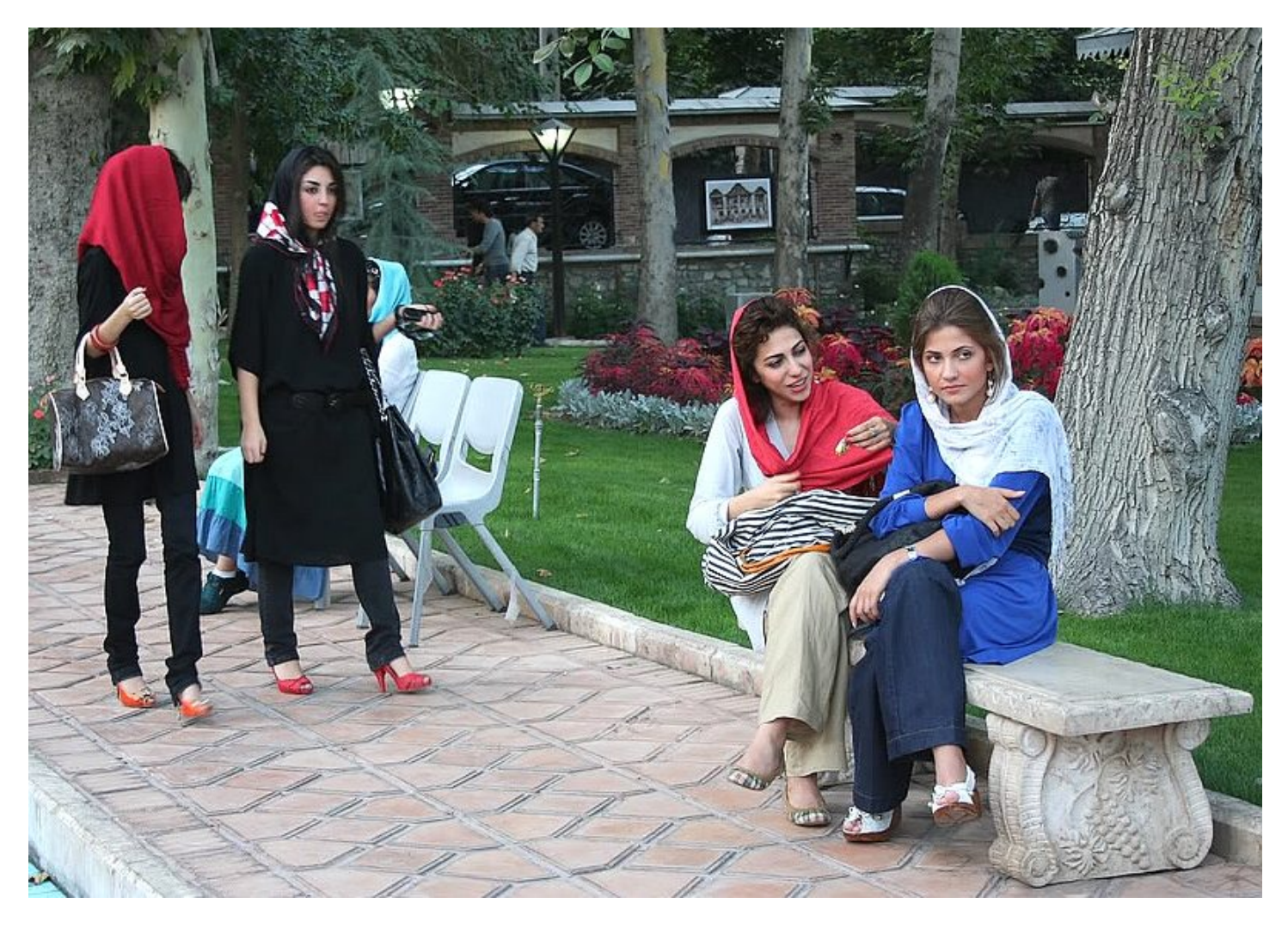
Here is Tehran at night