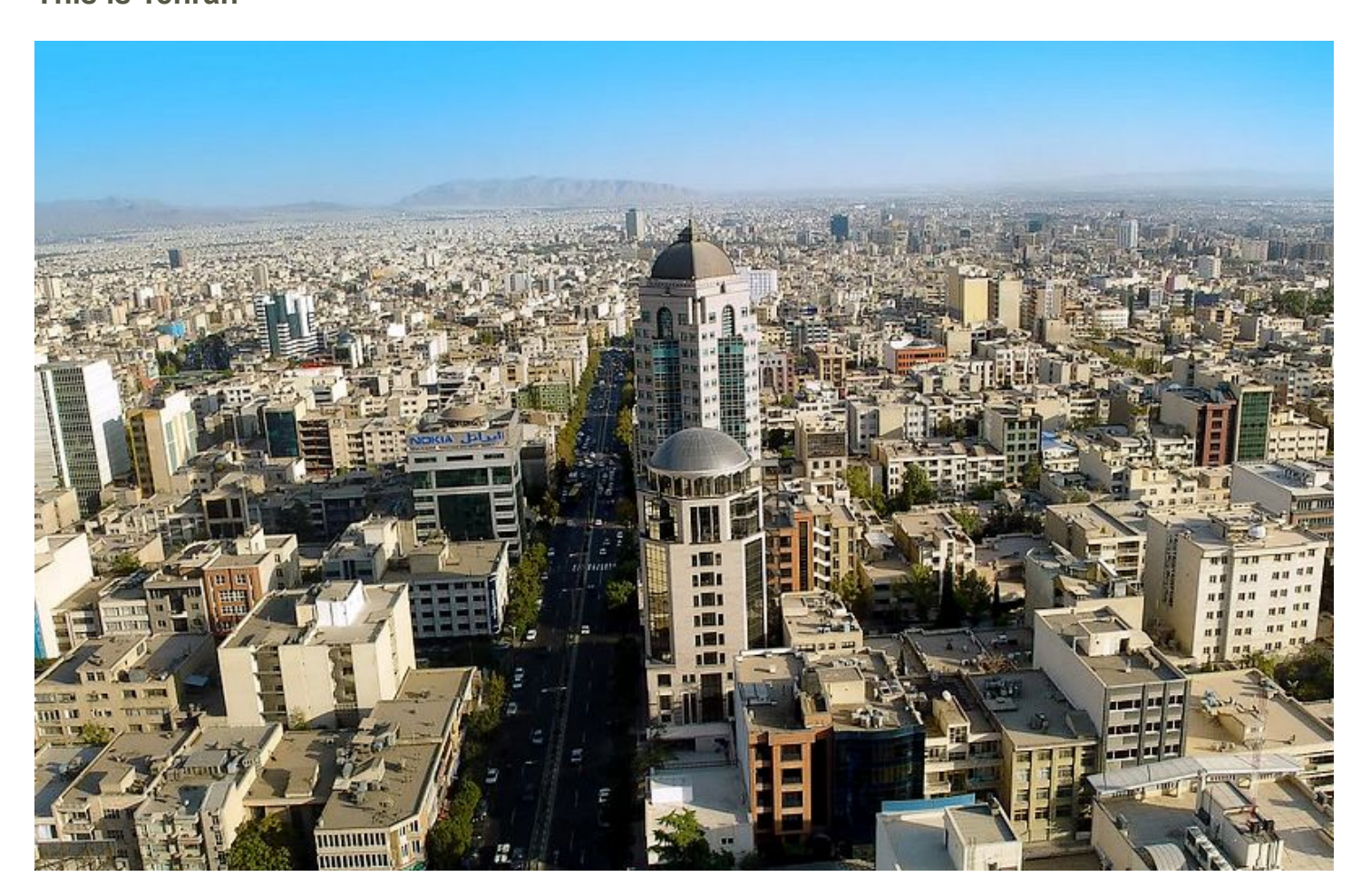
This is the city that Iran built the nuclear reactor for