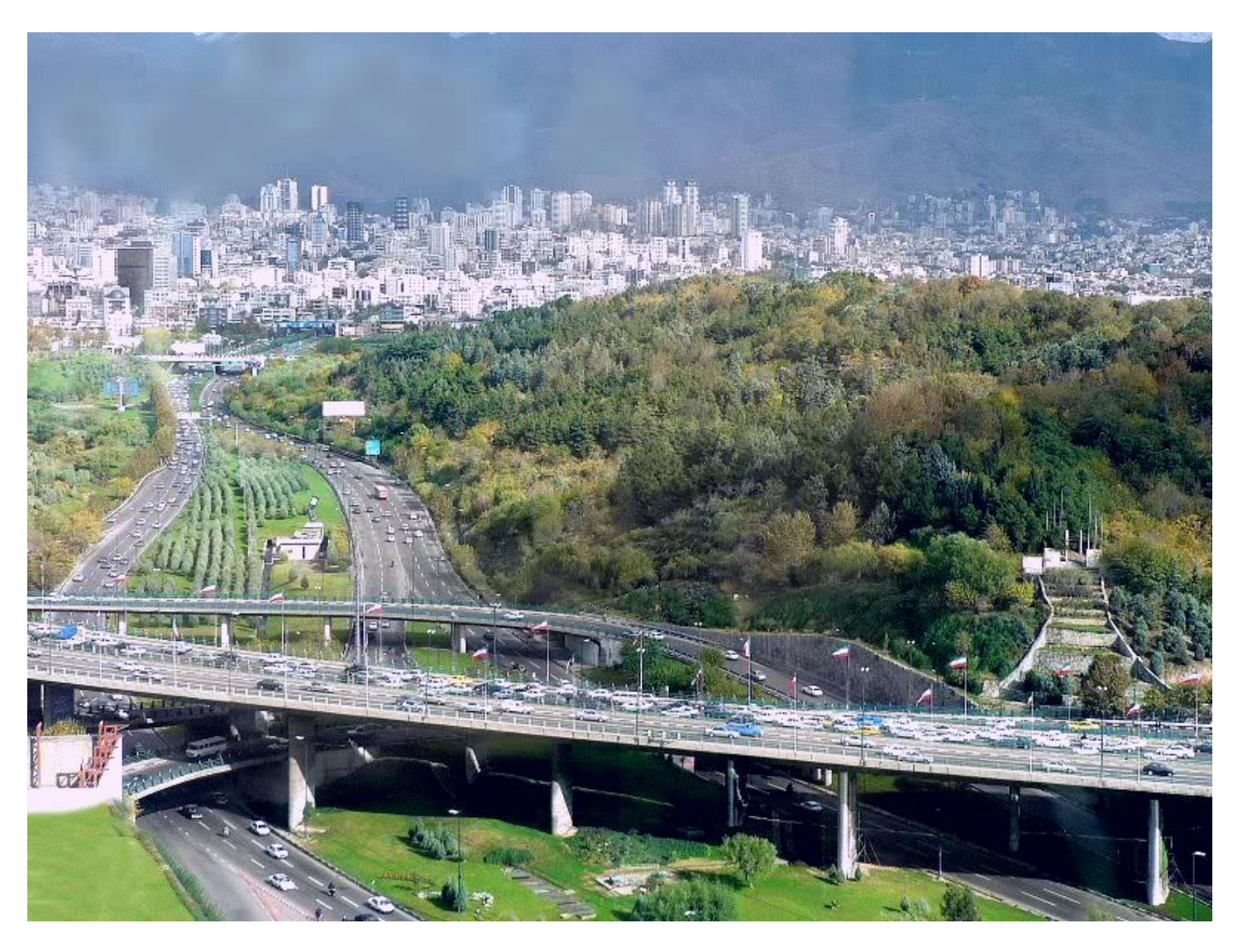
Another Iranian city