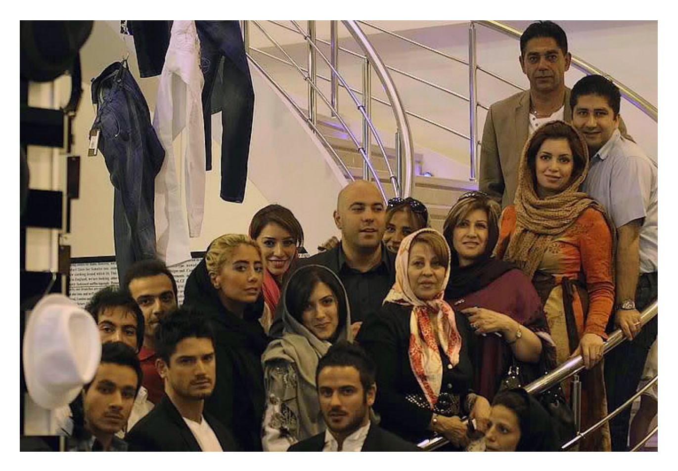
This is another major Iranian city