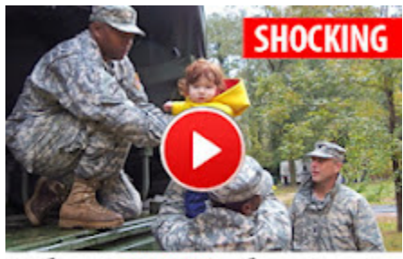
What is FEMA planning to do with your children

"...individuals who violate the terms of the agreement or the terms of the Federal order for quarantine, isolation, or conditional release (even if no agreement is in place between the individual and the government), he or she may be subject to criminal penalties."