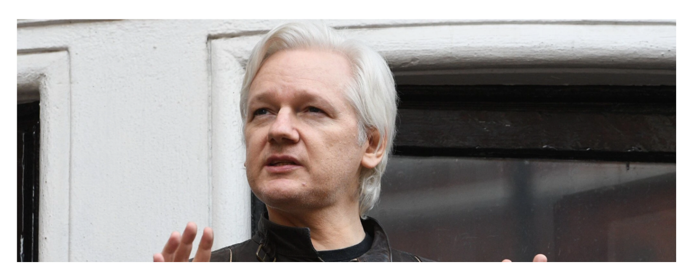
The New York Times, Feb. 21, 2021

How can you run around the world feigning anger over other countries ' persecution of independent journalists when you are a key part of the administration that is doing more than anyone to destroy one of the most consequential independent journalists of the last several decades? Indeed, as numerous journalists warned at the time, there were few, if any, administrations in U.S. history more hostile to basic press freedoms than the Obama administration in which Blinken previously served, <u>including prosecuting</u> double the number of journalistic sources under espionage laws than all previous administrations combined .