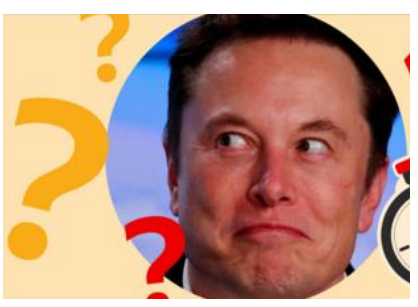
What's Elon Musk's valua of Twitter? Our timed qui