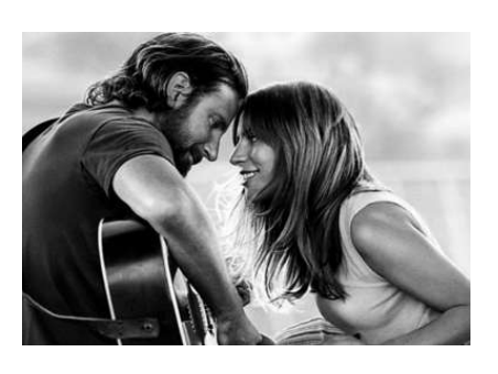
Make tonight a movie nig There's something for everyone on iPlayer