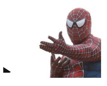
Nigeria's Spider-Man figh