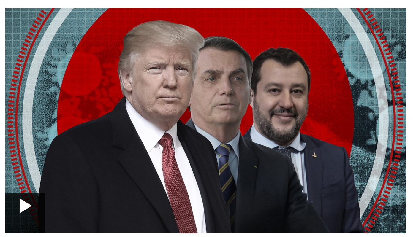
Reality Check debunks coronavirus claims by politicians

"A very unusual case. There are likely secrets hidden in the dark," one remark read.