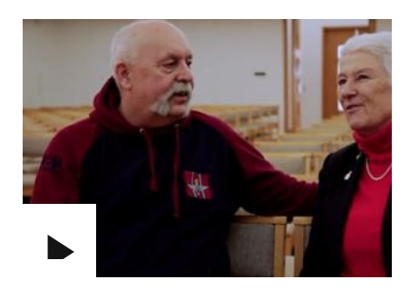
Injured Falklands veteran nurse reunited