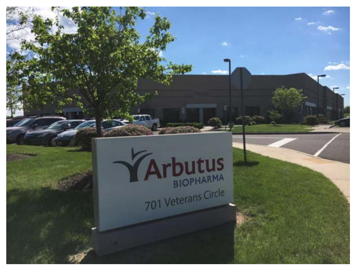
Arbutus Biopharma's office in Warminster, Pennsylvania