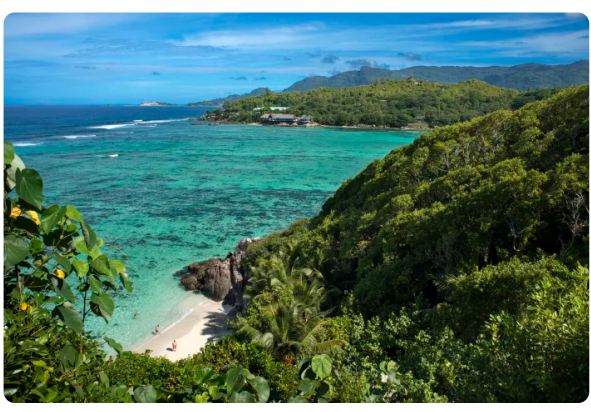
Moyenne Island, Seychelles.

The minister also said the situation is manageable and that the health system is not under pressure because people are not seriously ill with the disease.