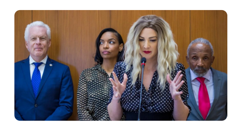
Homeowners With No Missed Payments Get Big Break