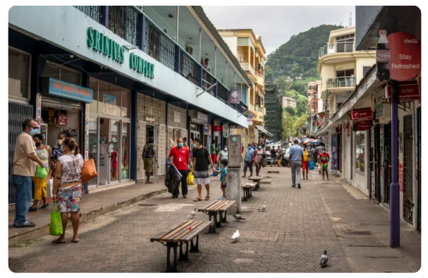
Pedestrians wear masks as they walk on a street in the capital Victoria, Mahe Island, Seychelles.

A COVID outbreak in the world's most vaccinated country has mostly spread among the people who haven't had a jab, a government minister has said.