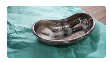
World's most vaccinated nation sees COVID-19 resurgence, raising questions over Chinese vaccine