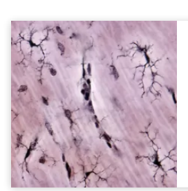
Could Vitamin Supplementation Help Alzheimer's Patients?