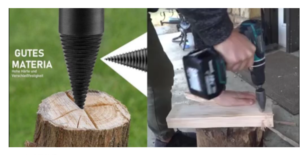
Ad: 0:02 / 0:17