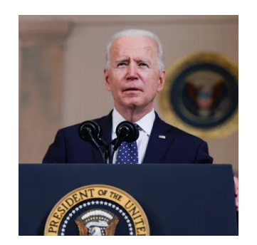
Biden Weighs Raising Capital Gains Rate to Over 40 Percent