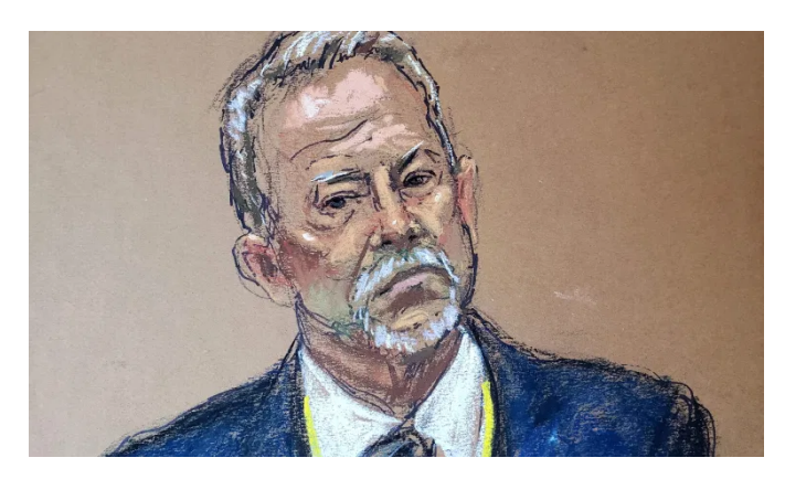
Chauvin Defense Expert Destroyed on the Stand