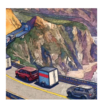
The Great California Exodus