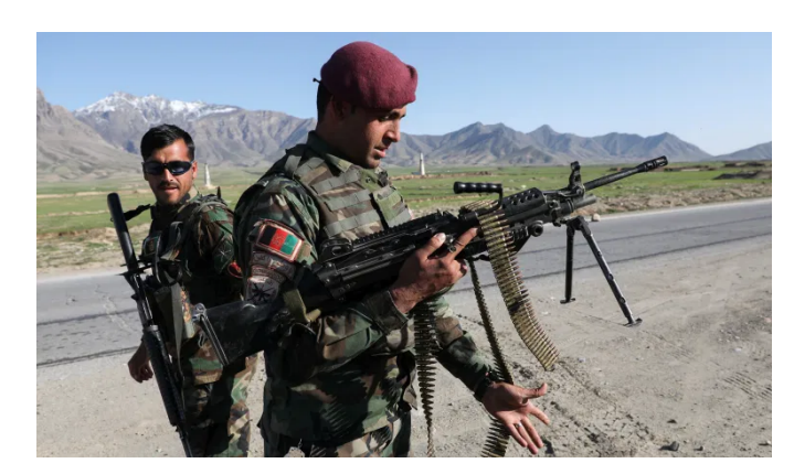
CENTCOM Head Claims Afghan Military 'Will Certainly Collapse' without U.S. Aid