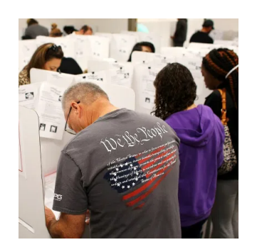
Why Not Fewer Voters?