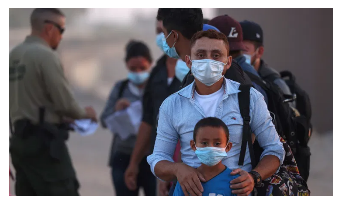
Politico Tells Staff to Avoid Referring to Border Situation as a 'Crisis'