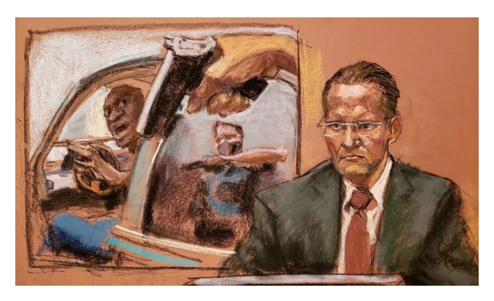
Powerful Evidence That George Floyd Resisted Arrest