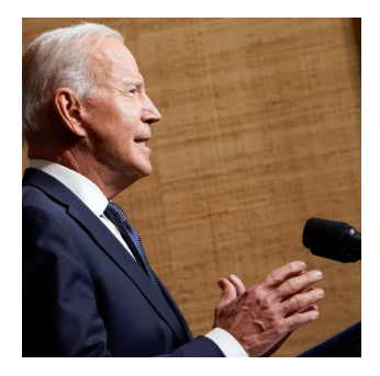
Biden Set to Push Critical Race Theory on U.S. Schools