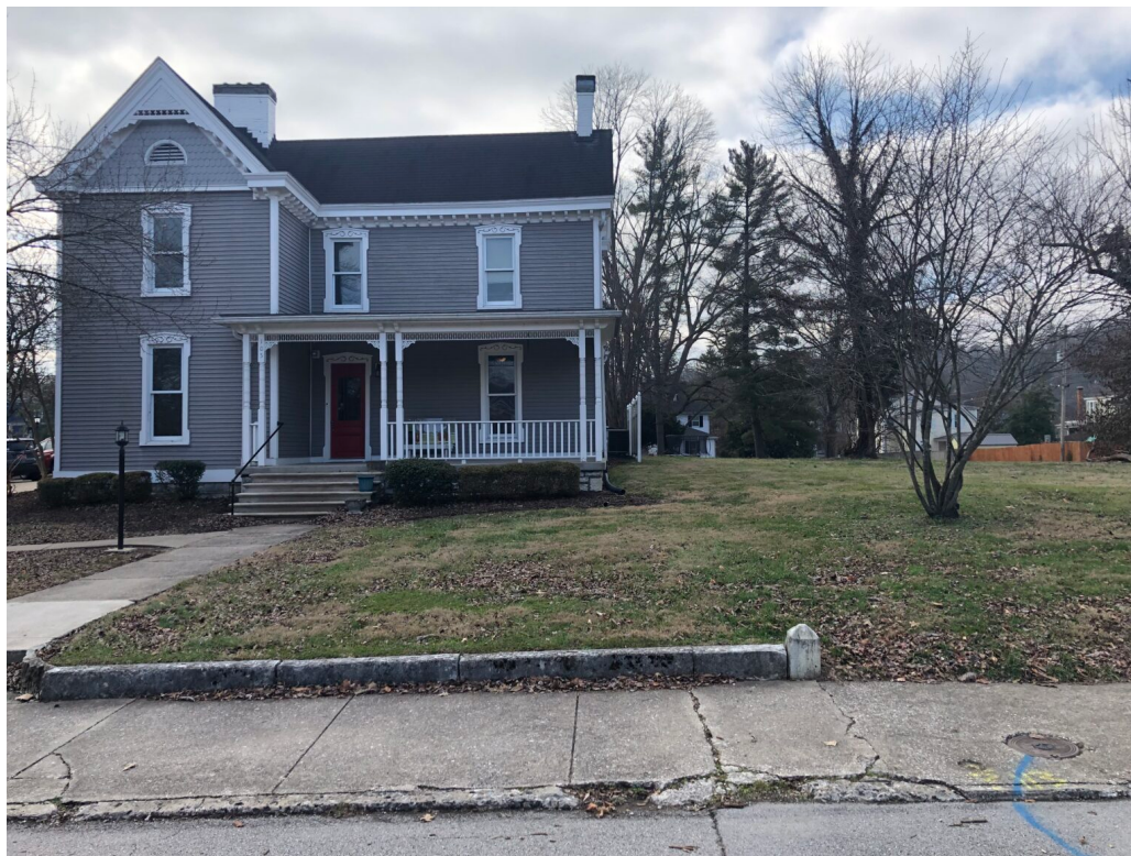
📷 Republican Party of Kentucky headquarters at the corner of Capitol Avenue and 3rd Street in Frankfort.

This article has been updated with new information.