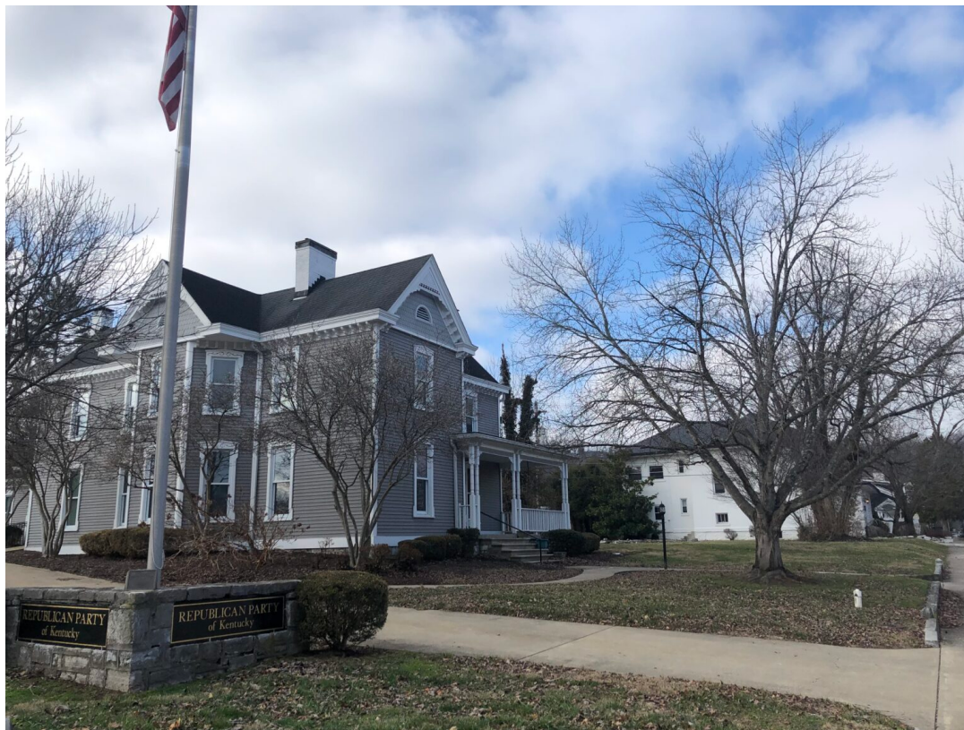
📷 Republican Party of Kentucky headquarters in Frankfort.

FRANKFORT, Ky. – In what may be the largest political contribution ever given to a political party in Kentucky, the drug maker Pfizer Inc. gave $1 million last month to the building fund of the Republican Party of Kentucky.