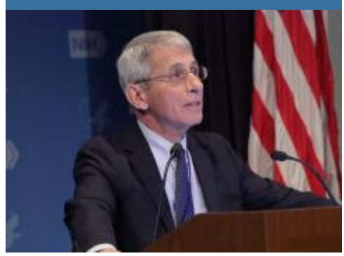
40 COMMENTS (/WIRE/TEXAS-ENDED-LOCKDOWNS-AND-MASK-MANDATES-NOW-LOCKED-DOWN-STATES-ARE-WHERE-COVID-GROWING-MOST#DISQUS_THREAD)

TAGS Bureaucracy and Regulation (/topics/bureaucracy-and-regulation)