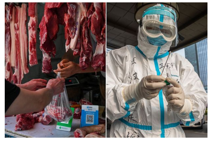
> Wuhan bans the eating of wild animals after coronavirus outbreak