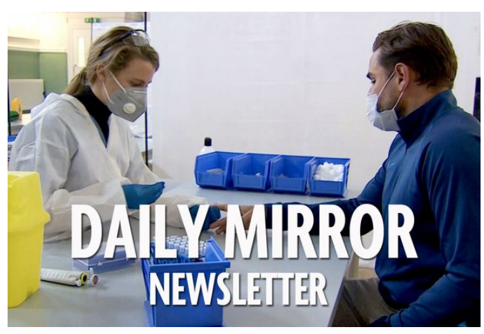
> Don't miss our coronavirus newsletter with all the essential information