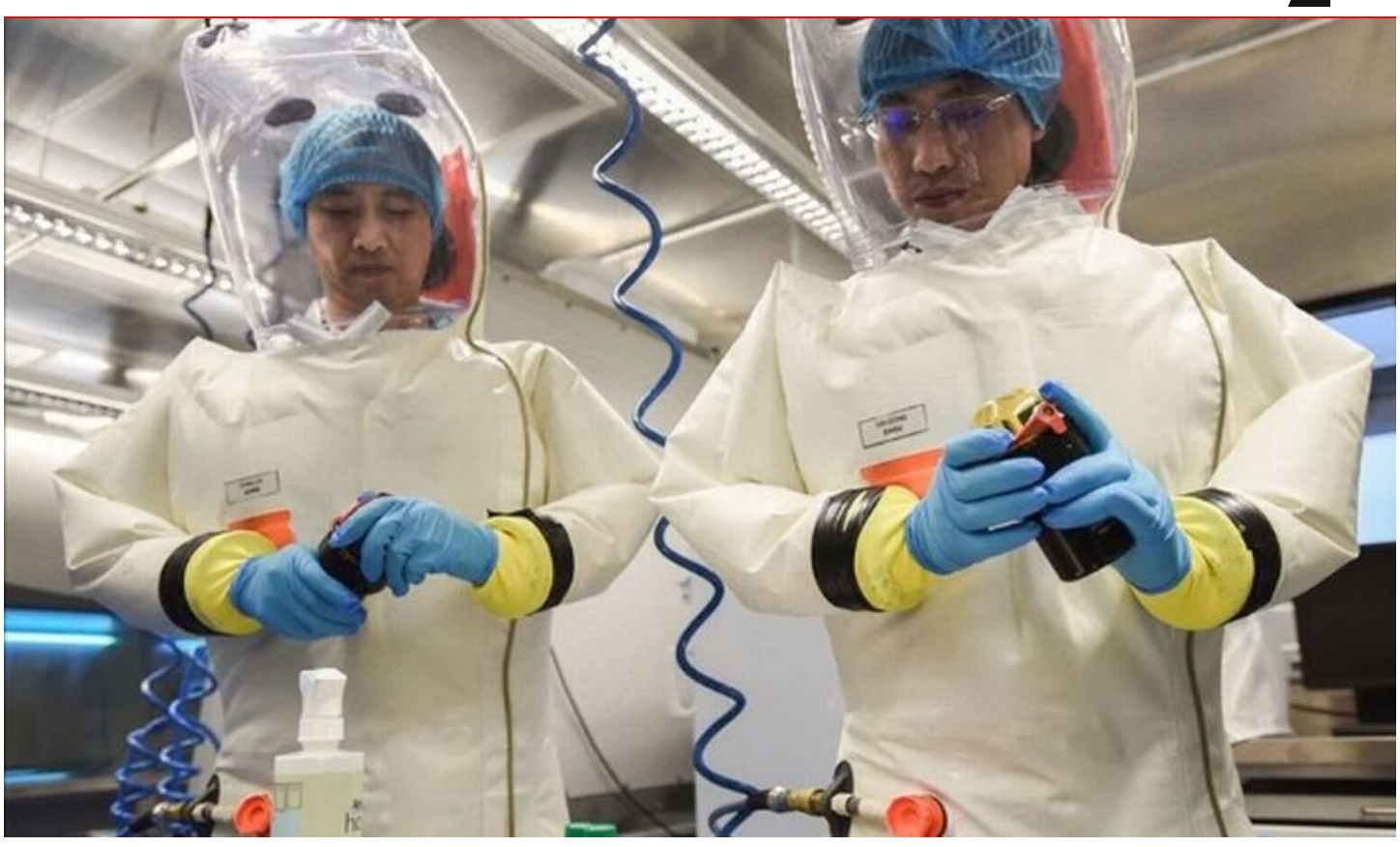
Some researchers at the Wuhan lab linked to the pandemic

Get our daily coronavirus email newsletter with all the news you need to know direct to your inbox