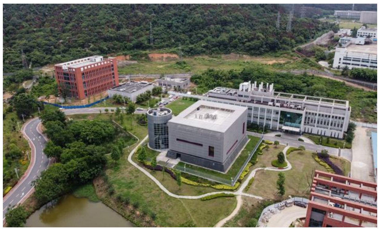
The Wuhan Institute of Virology in Wuhan