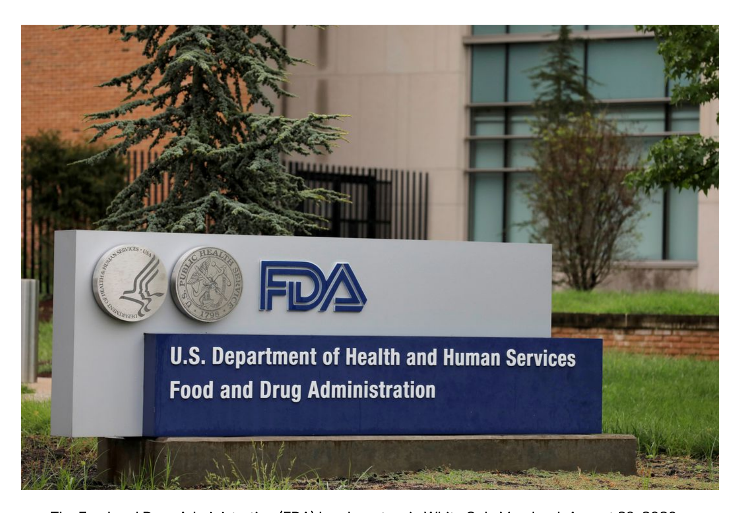
The Food and Drug Administration (FDA) headquarters in White Oak, Maryland, August 29, 2020.