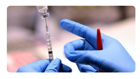
Some people still face barriers to getting a COVID vaccine, CDC says. Here's who