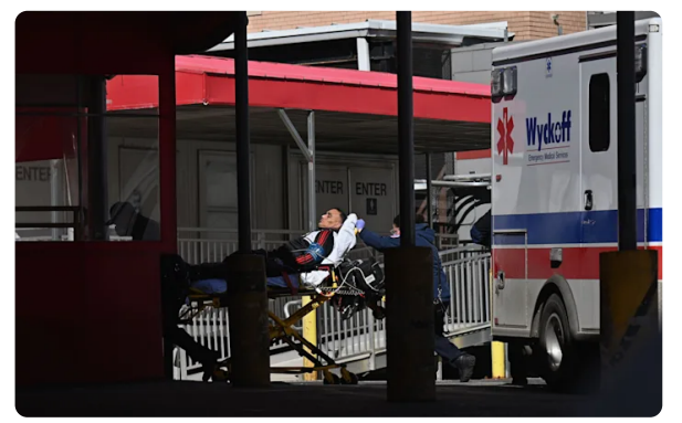
A person on a gurney is transported to Elmhurst Hospital Center on March 2 in New York City.

The problem is that experts don't know exactly how much immunity prior infection confers, or how long that immunity lasts.