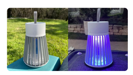
Goodbye Mosquito Bites, New Trap Is Selling Fast