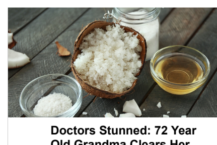
Old Grandma Clears Her Wrinkles With This Method