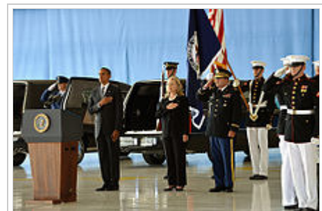
President Obama and Secretary Clinton honor the Benghazi attack victims at the Transfer of Remains Ceremony held at Andrews Air Force Base on September 14, 2012.