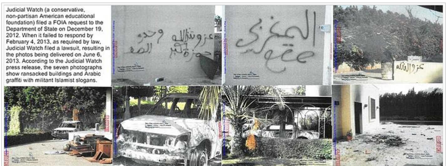
Montage of seven photographs released under a FOIA request to Judicial Watch from the Department of State.

Freedom of Information Act requests have been made since the attack. The conservative foundation Judicial Watch filed a FOIA request to the Department of State on December 19, 2012. An acknowledgement of the request was received by Judicial Watch on January 4, 2013. When the State Department failed to respond to the request by February 4, 2013, Judicial Watch filed a lawsuit, which resulted in seven photographs being