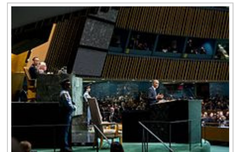
President Barack Obama addresses the United Nations General Assembly

On September 25, in an address before the United Nations General Assembly President Obama stated, "The attacks on our civilians in Benghazi were attacks on America ... And there should be no doubt that we will be relentless in tracking down the killers and bringing them to justice." [77][191] He referred to Innocence of Muslims as "a crude and disgusting video [that] sparked outrage throughout the Muslim world." He said, "I have made it clear that the United States government had nothing to do with this video, and I believe its message must be rejected by all who respect our common humanity." [192] He further stated, "There is no video that justifies an attack on an