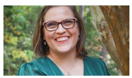
'I thought climate change was a hoax. Now I've changed my mind'