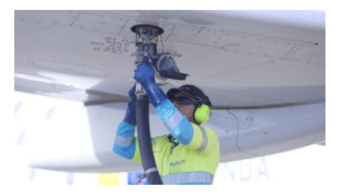
Could airports make hydrogen work as a fuel?