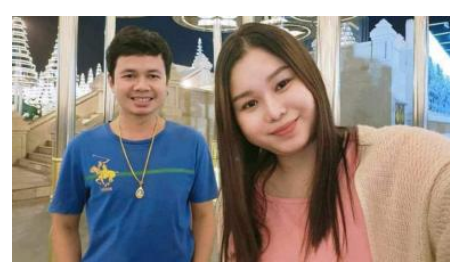
'I thought he died' - joy after Thai hostage freed