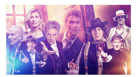
The changing face of Doctor Who