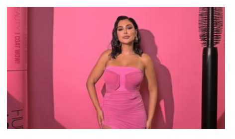
Beauty industry is sexist, says make-up icon