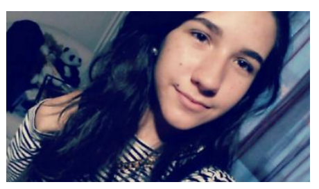
Italian woman's killing sparks nationwide reckoning