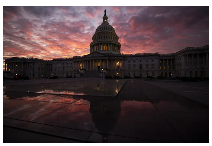
Congress Hit New Levels Of Absurdity This Week