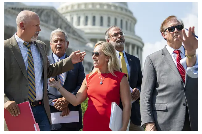
A Group Of Republicans Could Briefly Shut Down The Government Over Vaccine Mandates