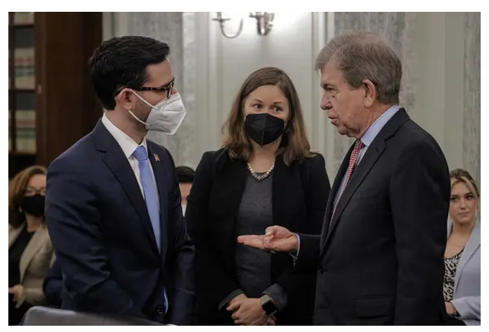
COVID Scams Are Surging, But Congress Isn't Giving The Government Power To Repay Victims