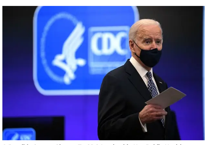
A Possible Senate Change To CDC Leadership Has Public Health Experts Worried