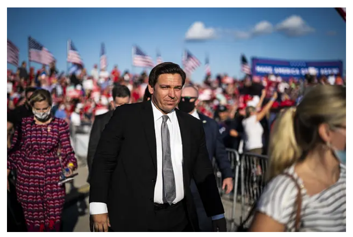
Florida Republicans Are Creating An Office Of Election Crimes As Trump's Fraud Claims Continue To Spread