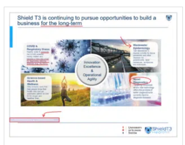
Pg. 4 of Power Point Presentation: SHIELD T3 Executive Committee Meeting Public Session. University of Illinois System (Feb. 11, 2022).

becomes very widely recognized, however, COVID-19 is being seen as an endemic disease, and therefore, one of many background infectious diseases. So, Shield T3's plan is to rapidly repurpose existing PCR equipment and infrastructure to test not only for COVID-19 but also for any number of other diseases including, most notably, influenza and RSV.