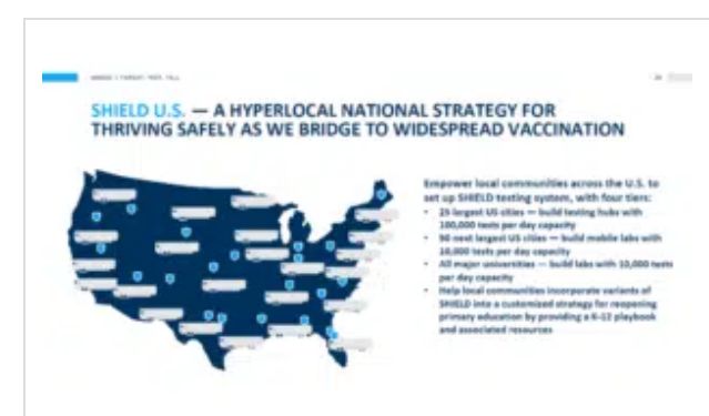
Pg. 20 of Power Point Presentation: SHIELD U.S. A COVID-19 testing system to get the U.S. back up and running more safely as we bridge to widespread vaccination. University of Illinois System (Dec. 14, 2020)

The SHIELD plan, originally code named "the Manhattan Project" by scientists at the university who were developing it, was presented to then-President-elect Joe Biden's team in December 2020. Invoking the World War II era code name for the project that led to the creation of the first atomic bombs is likely no accident. There's a world war raging for control