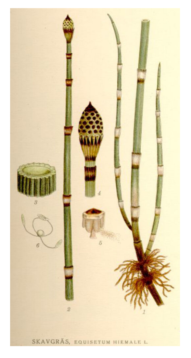
Carl Axel Magnus Lindman, Public domain, via Wikimedia Commons