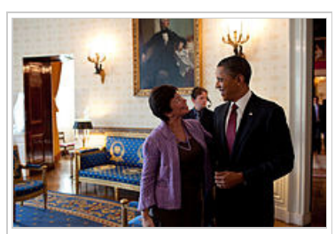
Barack Obama chats with Valerie Jarrett in the Blue Room, White House, 2010.