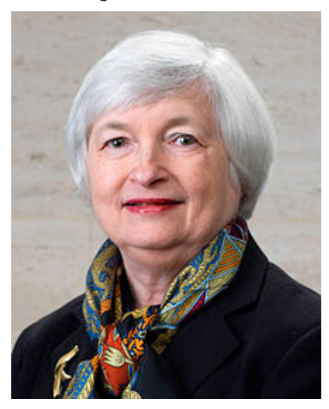
15th Chair of the Federal Reserve