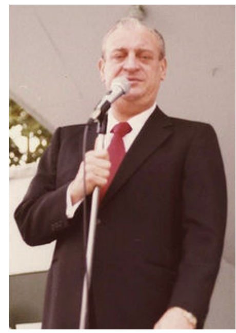
Dangerfield during an open air show in New York in 1978