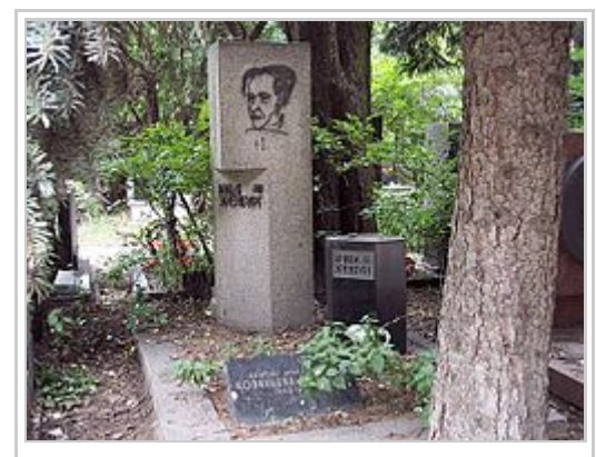
Ilya Ehrenburg's grave with a wire reproduction of his portrait by Picasso