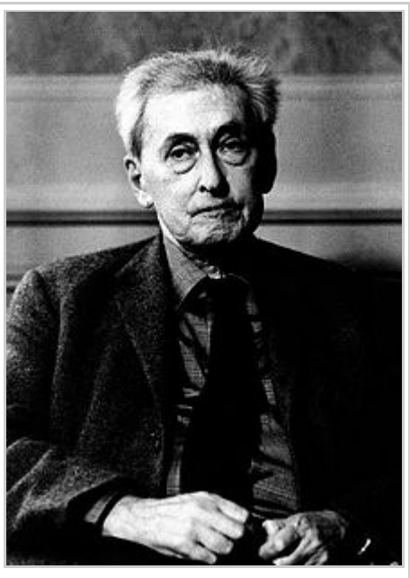
Ilya Ehrenburg in the 1960s