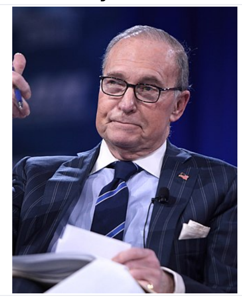
12th Director of the National Economic Council