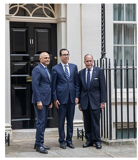
<u>Sajid Javid</u>, <u>Steven Mnuchin</u> and Kudlow at 11 Downing Street, 2019

In the summer of 2019, Kudlow twice asserted that the proposed <u>United States-Mexico-Canada Agreement</u> would increase GDP by half a percentage point and job creation by 180,000 per year after ratification. The <u>International Trade Commission</u> analysis that he was apparently referencing estimated that the Agreement would increase GDP by 0.35%