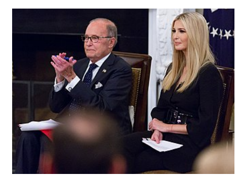
Kudlow with <u>Ivanka Trump</u> in 2018

the tax plan, whether by non-partisan organizations, Wall Street analysts, or right-leaning research organizations, showed that the tax plan would increase the deficit. [14] In July 2018, Kudlow supported his earlier opinion that the CBO is not credible when he asserted, "Even the CBO numbers show now that the entire $1.5 trillion tax cut is virtually paid for by higher revenues and better nominal GDP." The CBO later found that the tax cut reduced revenues and that the resulting deficits increased by $1.9 trillion after accounting for macroeconomic feedback. [15]