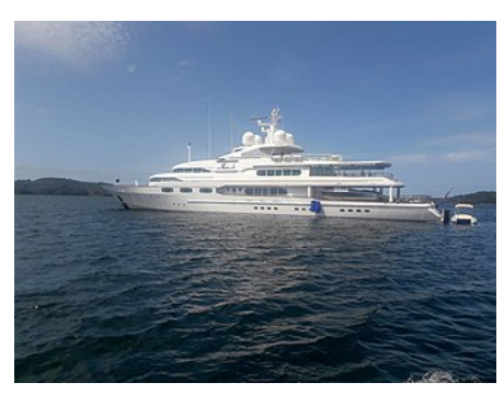
The <u>Dancing Hare</u> yacht, formerly known as the <u>Lady</u> <u>Ghislaine</u>

In November 1991, Robert Maxwell's body was found floating in the sea near the Canary Islands and Lady Ghislaine .<sup>[37]</sup> Soon