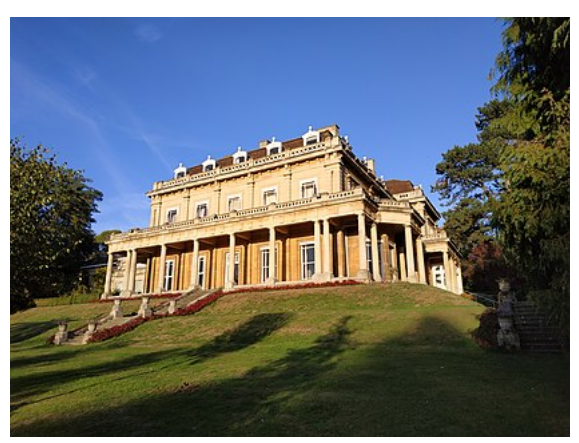
Headington Hill Hall, Oxford