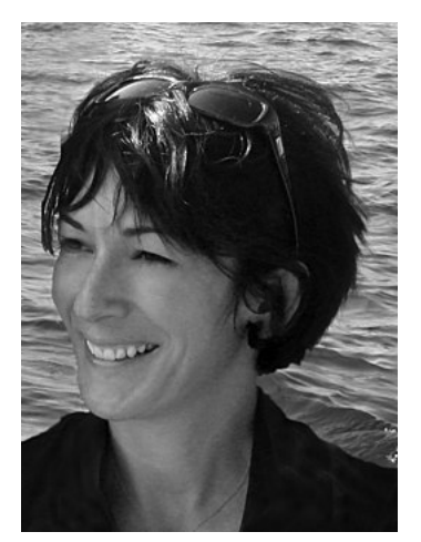
Maxwell in 2007

In 2008, Epstein was convicted of soliciting a minor for prostitution and served 13 months of an 18-month jail sentence. Following Epstein's release, although Maxwell continued to attend prominent social functions, she and Epstein were no longer seen together publicly.<sup>[10]</sup>