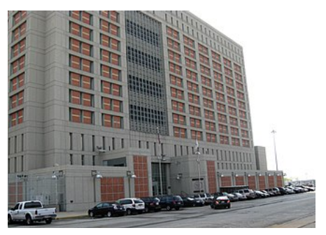
Metropolitan Detention Center, Brooklyn

Prosecutors, led by United States District Attorney <u>Audrey</u> <u>Strauss</u>, charged Maxwell with six federal crimes, including enticement of minors, <u>sex trafficking</u> of children, and perjury. [11][106][107][108][109][110] The indictment charged that between