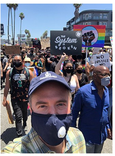
Schiff at <u>George Floyd protest</u> in Los Angeles

In April 2019, Schiff voted for a bipartisan resolution under the War Powers Act to end U.S. involvement in the war. [52][53] It passed the Senate, but after passing the House it was vetoed. [54]