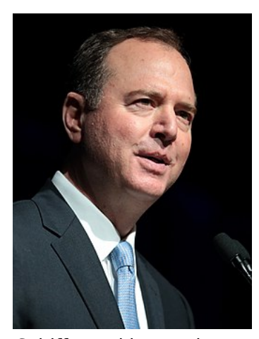
Schiff speaking to the California Democratic Party in June 2019.

In 2000, Schiff challenged Republican incumbent Jim Rogan in what was then the 27th district. The district had once been a Republican stronghold, but had been trending Democratic since the early 1990s. In what was the most expensive House race ever at the time<sup>[108]</sup> (several elections in 2006<sup>[109]</sup> and 2008<sup>[110]</sup> later eclipsed it), Schiff unseated Rogan, taking 53% of the vote to Rogan's 44%. He became only the second Democrat to represent this district since its creation in 1913.