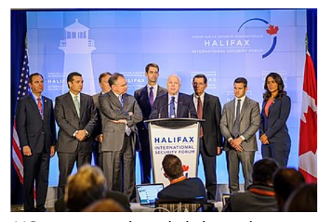
US congressional delegation at Halifax International Security Forum 2014