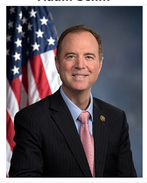
Chair of the House Intelligence Committee