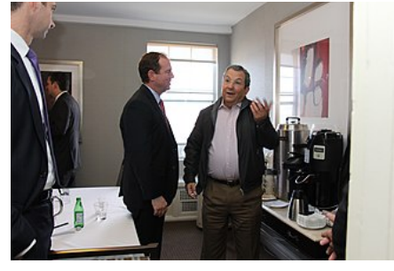
Schiff with former <u>Israeli</u> Prime Minister <u>Ehud Barak</u> in November 2014

tremendous red herring and a waste of taxpayer resources". [43] Despite those reservations, he still accepted an appointment to the Committee because if he felt he "could add value, [he] would serve". [44]