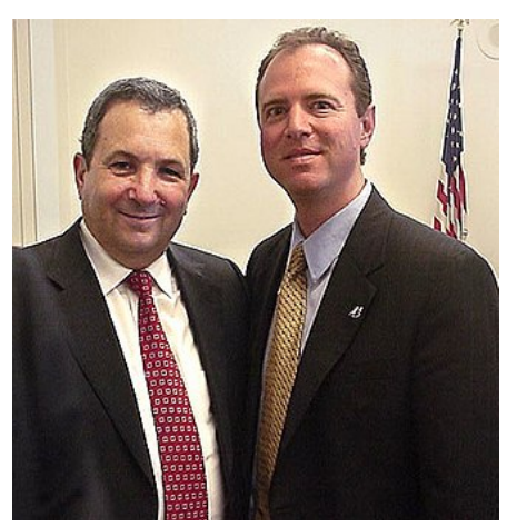
Schiff with former <u>Israeli Prime</u> Minister Ehud Barak in 2002

In February 2019, Representative Ilhan Omar tweeted, "It's all about the Benjamins baby" in reference to American politicians' support for Israel and invoked the American Israel Public Affairs Committee (AIPAC). The tweet received widespread bipartisan condemnation, including from many Democratic leaders as well as Schiff, for implying that lobby money was fueling American politicians' support of Israel. Schiff said it was "never acceptable to give voice to, or repeat, anti-Semitic smears". [79]