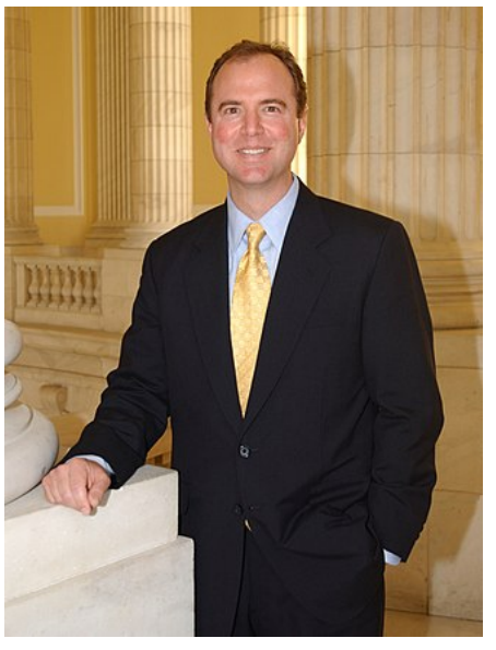
Schiff at the <u>United States</u> <u>Capitol</u> during the 115th Congress

Nancy Pelosi appointed Schiff to the House Select Committee on Benghazi in 2014 as one of the five Democrats on the committee. [41] He had participated in the House Permanent Select Committee on Intelligence investigation into the attacks on the Benghazi diplomatic compound, which found that the initial talking points the intelligence community provided were flawed but not intended to deceive, and that diplomatic facilities across the world lacked adequate security. [42] The report's findings were unanimous and bipartisan. Before he was appointed to the Benghazi Select Committee, Schiff called the establishment of a select committee to investigate the 2012 attack a "colossal waste of time" and said Democratic leaders should not appoint any members, stating: "I think it's just a