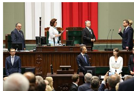
Andrzej Duda taking the oath of office, 6 August 2015

On 28 December 2015, Duda signed the Constitutional Tribunal bill (passed on 22 December 2015 by the Sejm), which unequivocally breaches the Constitution of Poland in the opinion of the National Council of the Judiciary of Poland , [39] the Public Prosecutor General [40] and the Polish