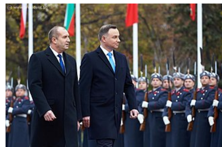
Duda with Bulgarian President Rumen Radev in an official visit to Bulgaria in November 2018