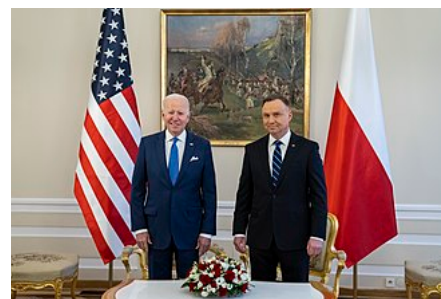
Duda with US President Joe Biden in March 2022