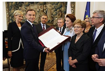
Andrzej Duda during a meeting with the Council of Seniors of the Sejm and the Council of Seniors of the Senate at the Sejm

In February 2018, Duda said that he would sign into law Amendment to the Act on the Institute of National Remembrance , making it illegal to accuse 'the Polish nation' of complicity in the Holocaust and other Nazi German atrocities, a measure that has roiled relations with Israel with Prime Minister Benjamin Netanyahu going as far as accusing the Polish government of " Holocaust denial ". [43][44][45]