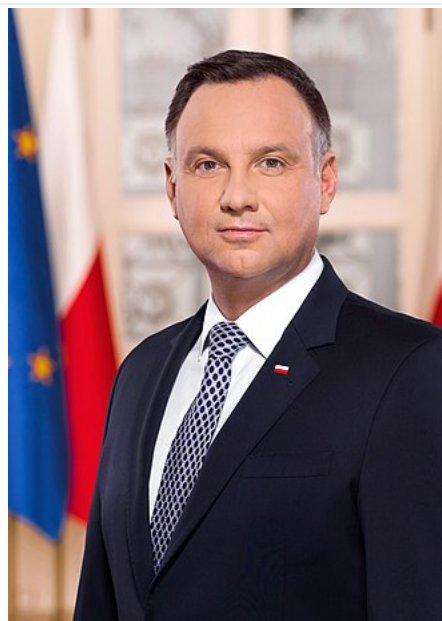
Official portrait, 2019