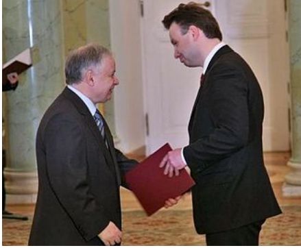
Former President Lech Kaczyński appointing Duda as undersecretary of state in the Chancellery of the President, 16 January 2008

in the Chancellery of the President of the Republic of Poland. [10] In 2010, he was an unsuccessful candidate to become the Mayor of Kraków as a PiS candidate, [11] but was more successful in the 2011 parliamentary election, where he received 79,981 votes for the Kraków area, and thus became member of the Sejm . [12]