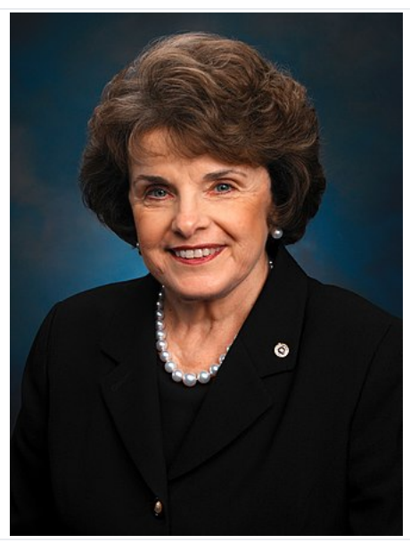
United States Senator from California