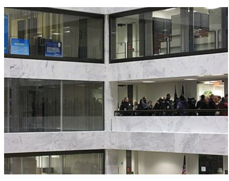
The 2009 line outside Feinstein's office for unclaimed tickets to the First inauguration of Barack Obama