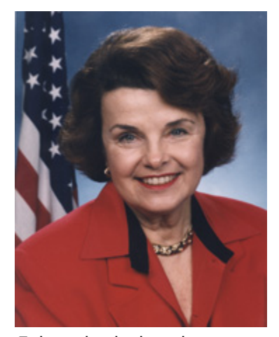
Feinstein during the 108th Congress

Feinstein co-sponsored (with Oklahoma Republican <u>Tom Coburn</u>) an amendment through the Senate to the Economic Development Revitalization Act of 2011 that eliminated the Volumetric Ethanol Excise Tax Credit. The Senate passed the amendment on June 16,