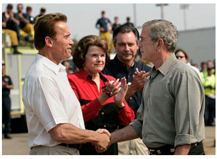
Feinstein with President George W. Bush and California Governor Arnold Schwarzenegger, October 25, 2007

It is time for a rational plan for defense conversion instead of the random closing of bases and the piecemeal cancellation of defense contracts. Otherwise, we risk losing, for both state and nation, the greatest resources of scientific, technical and human capital ever gathered together in human history. [51]