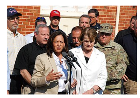
Feinstein (white coat) and Kamala Harris in 2017

Feinstein chaired the United States Congress Committee Joint Inaugural Ceremonies and acted as mistress ceremonies, introducing participant at the each 2009 presidential inauguration.[130] She is the first woman to have presided over