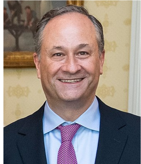
Douglas Emhoff, 2022