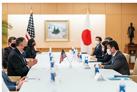
Emhoff meets with Japanese Foreign Minister Toshimitsu Motegi in Tokyo, August 2021