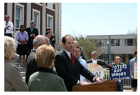
Spitzer speaking in April 2007