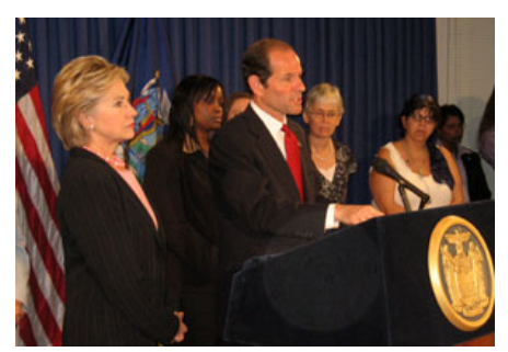
Spitzer with <u>Hillary Clinton</u> in 2007

On September 21, 2007, Spitzer issued an executive order directing that state offices allow illegal immigrants to be issued driver's licenses effective December 2007. [76][77] Applicants for driver's licenses would not be required to prove legal immigration status and would be allowed to present a foreign passport as identification. [77] In October 2007, after meeting with the Department of Homeland Security, Spitzer altered the plan so that licenses issued to migrant workers would look different from other licenses and that the new licenses would not allow access to airplanes and federal buildings. [78]