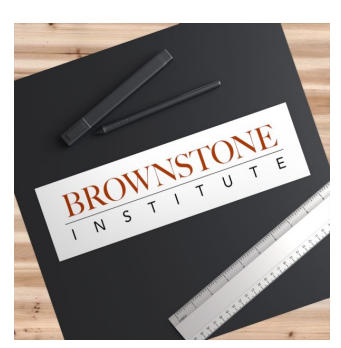
Bumper Stickers $7.00 - $8.00