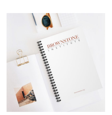
Brownstone Spiral Notebook $11.00