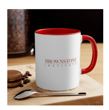
11oz Accent Mug $12.00