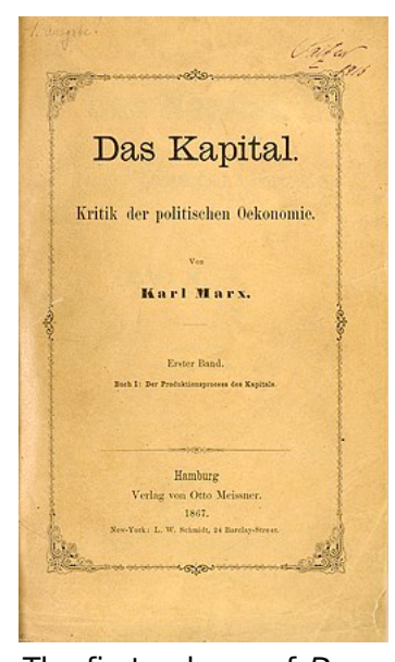
The first volume of \underline{\textit{Das}} Kapital

In 1864, Marx became involved in the International Workingmen's Association (also known as the First International), [121] to whose General Council he was elected at its inception in 1864. [156] In that organisation, Marx was involved in the struggle against the anarchist wing centred on Mikhail Bakunin (1814–1876). [134] Although Marx won this contest, the transfer of the seat of the General Council from London to New York in 1872, which Marx supported, led to the decline