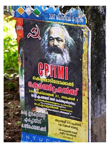
CPI(M) mural in Kerala, India