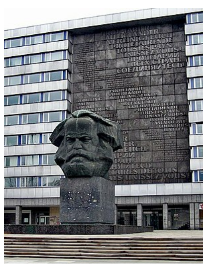
Karl Marx Monument in Chemnitz (known as Karl-Marx-Stadt from 1953 to 1990)

Marx spent some time in French Algeria, which had been invaded and made a French colony in 1830, and had the opportunity to observe life in colonial North Africa. He wrote about the colonial justice system, in which "a form of torture has been used (and this happens 'regularly') to extract confessions from the Arabs; naturally it is done (like the English in India) by the 'police'; the judge is supposed to know nothing at all about it."[256] Marx was surprised by the arrogance of many European settlers in Algiers and wrote in a letter: "when a European colonist dwells among the 'lesser breeds,' either as a settler or even on business, he generally regards himself as even more inviolable than handsome William I [a Prussian king]. Still, when it comes to bare-faced arrogance and