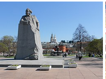
Moscow, whose inscription reads: "Proletarians of all countries, unite!

Marx's view of capitalism was two-sided. [78][149] On one hand, in the 19th century's deepest critique of the dehumanising aspects of this system he noted that defining features of capitalism include alienation, exploitation and recurring, cyclical depressions leading to mass unemployment. On the other hand, he characterised capitalism as "revolutionising, industrialising and universalising qualities of development, growth and progressivity" (by which Marx meant industrialisation, urbanisation, technological progress, productivity and increased growth, rationality and scientific revolution) that are