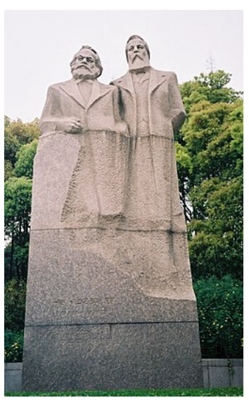
A monument dedicated to Marx and Engels in Shanghai, China

Commodity fetishism provides an example of what Engels called "false consciousness", [235] which relates closely to the understanding of ideology. By "ideology", Marx and Engels meant ideas that reflect the interests of a particular class at a particular time in history, but which contemporaries see as universal and eternal. [236] Marx and Engels's point was not only that such beliefs are at best half-truths, as they serve an important political function. Put another way, the control that