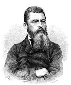
The philosophers <u>G.W.F. Hegel</u> and <u>Ludwig Feuerbach</u>, whose ideas on dialectics heavily influenced Marx