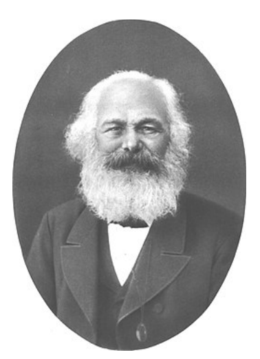
Marx in 1882

In a letter to <u>Vera Zasulich</u> dated 8 March 1881, Marx contemplated the possibility of Russia's bypassing the capitalist stage of development and building communism on the basis of the common ownership of land characteristic of the village \underline{mir} . While admitting that Russia's rural "commune is the fulcrum of social