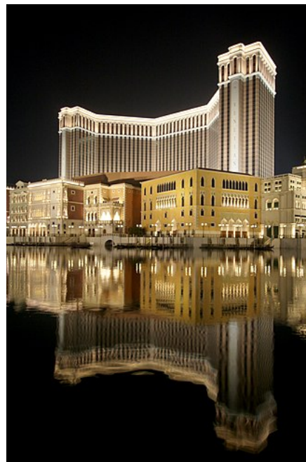
The Venetian Macao , the seventh-largest building in the world by floor space

MBS Singapore includes stores at "The Shoppes", an ultraluxury indoor Venetian canal-lined exclusive shopping belt with tenants such as Ferrari , Chanel , the Theatre of Marina Bay and Convention Center for Sands Live concert series, multiple swimming pools, a rooftop infinity pool, night clubs in Maison pavilions on newly constructed mini islands, and 2,500 luxury hotel rooms. [47][48][49]