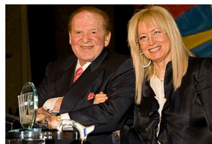
Sheldon and Miriam Adelson, at the Woodrow Wilson Awards