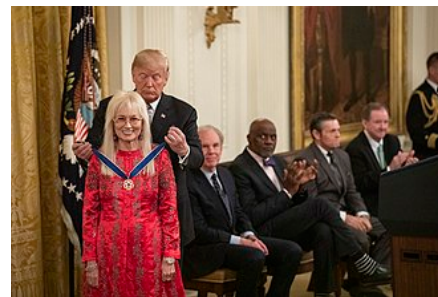
Donald Trump presents the Medal of Freedom to Adelson's wife.