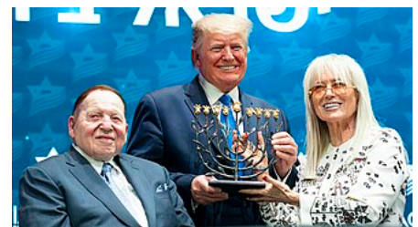
Adelson with Donald Trump in 2019

In February 2012, Adelson told Forbes magazine that he was "against very wealthy people