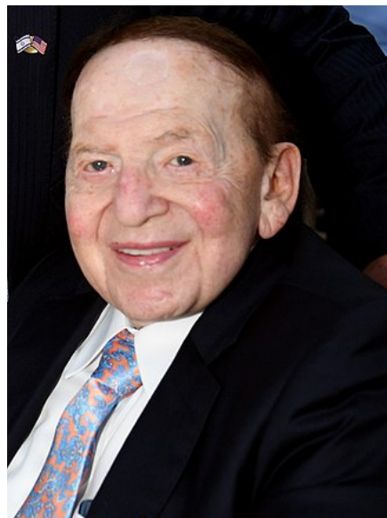
Adelson in 2019

Chinese officials in order to obtain the Macau license, took Adelson to court in Las Vegas alleging he had reneged on his agreement to allow Suen to profit from the venture. Suen won a $43.8 million judgement; in November 2010, the Nevada Supreme Court overturned the judgment and returned the case to the lower court for further consideration. [133] In the 2013 retrial, the jury awarded Suen a verdict for $70 million. [134][135] The judge added another $31.6 million in interest, bringing the total judgment against Adelson to $101.6 million. [136][137] Adelson was in the process of appealing again. [138] Adelson faced another trial over claims by three alleged "middlemen" in the deal who are suing for at least $450 million. [30]