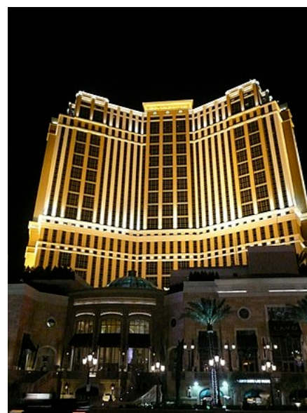
The Palazzo , Las Vegas

In the late 2000s, Adelson and the company built a casino resort in Bethlehem, Pennsylvania . It is one of five stand-alone casinos that were awarded a slots license by the Pennsylvania