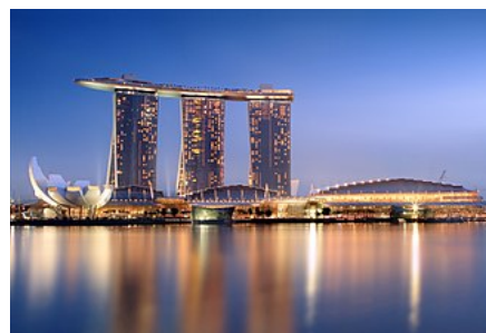
Marina Bay Sands , Singapore, the twelfth-most expensive building in the world