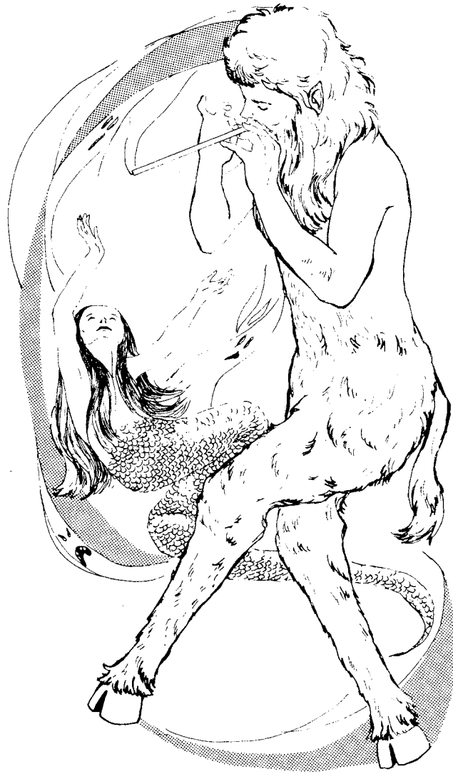
Demons from the third order appeared to be part man—part animal, resembling figures of Greek Mythology.