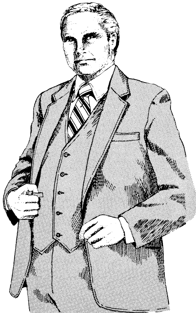
The demon of greed resembled an ordinary man dressed in a business suit.

fact, me and mine came before anything or anyone. As I look back, I can see the selfishness in my life which is the by-product of greed.