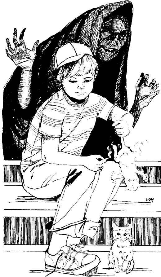
Artist's concept of the form and shape of the mystery demon.

me that all spirit beings have only one soul or personality. That includes the spirit of man that lives in the physical body. If that physical body starts to show more than one personality, then that body has more than one spirit living in it. There are no exceptions, ifs, ands, or buts about it. In such circumstances this would be demon possession — plain and clear. Another fact is that it is impossible for a spirit to live in and control a physical body without revealing himself in the form of a personality to others. This is true of the spirit of man as well as the spirit of demons.