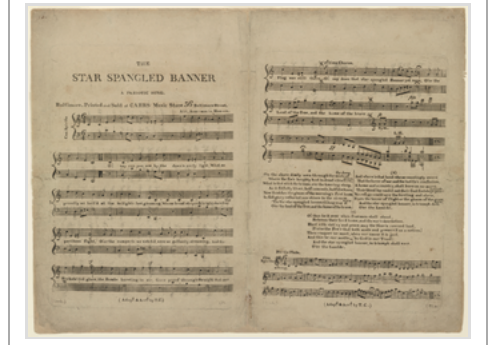
The earliest surviving sheet music of "The Star-Spangled Banner" from 1814