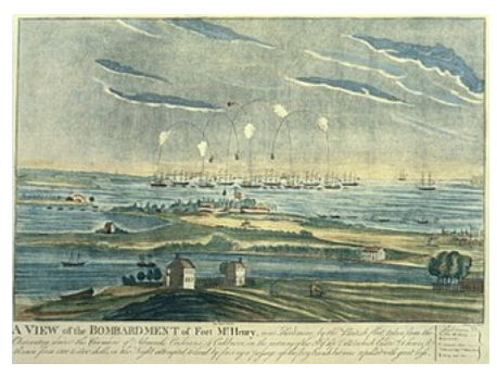
An artist's rendering of the battle at Fort McHenry

During the bombardment, <u>HMS Erebus</u> provided the "rockets' red glare", while the heavy-mortar bomb ships <u>HMS Terror</u>, <u>Volcano</u>, <u>Devastation</u>, <u>'Meteor</u> and <u>Aetna</u> provided the "bombs bursting in air".<sup>[10]</sup> Around 1,500 to 1,800 bomb shells and over 700 rockets were fired at the fort but with minimal casualties and damage being done. Only four men died and 24 were wounded in the fort. The ships were forced to fire from their maximum range (with minimal accuracy) to stay out of range of the fort's formidable cannon fire.<sup>[8][6]</sup>