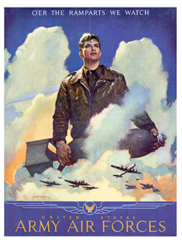
O'er the ramparts we watch in a 1945 <u>United</u> <u>States Army Air Forces</u> poster

The first popular music performance of the anthem heard by the mainstream U.S. was by Puerto Rican singer and guitarist José Feliciano. He created a nationwide uproar when he strummed a slow. blues-style rendition of the song<sup>[55]</sup> at Tiger Stadium in Detroit before game five of the 1968 World Series, between Detroit and St. Louis.[56] This rendition started contemporary "Star-Spangled Banner" controversies. The response from many in the Vietnam War-era U.S. generally negative. Despite the controversy, Feliciano's was performance opened the door for the countless interpretations of the "Star-Spangled Banner" heard in the years since.<sup>[57]</sup> One week after Feliciano's performance, the anthem was in the news again when U.S. athletes Tommie Smith and John Carlos lifted controversial raised fists at the 1968 Olympics while the "Star-Spangled Banner" played at a medal ceremony. Rock guitarist Jimi Hendrix often included a solo instrumental performance at concerts from 1968 to his death in 1970. Using high gain and distortion amplification effects and the vibrato arm on his guitar, Hendrix was able to simulate the sounds of rockets