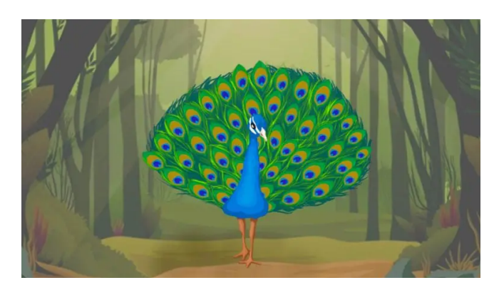
The Sad Peacock