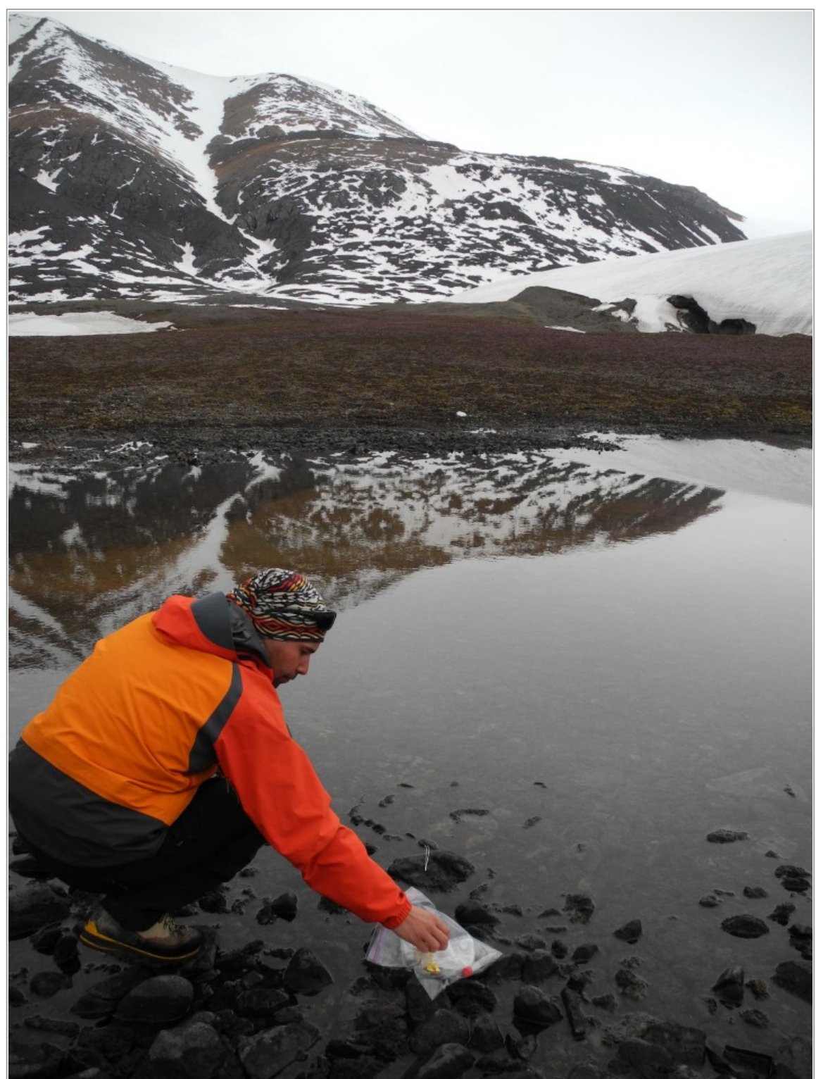
Team member taking samples near the glacier where the message in a bottle was found

Surprisingly, Vincent and Sarrazin didn't keep the letter. After anchoring it down with rocks for a photo (at top), it was reinserted into the bottle, along with a new message asking the