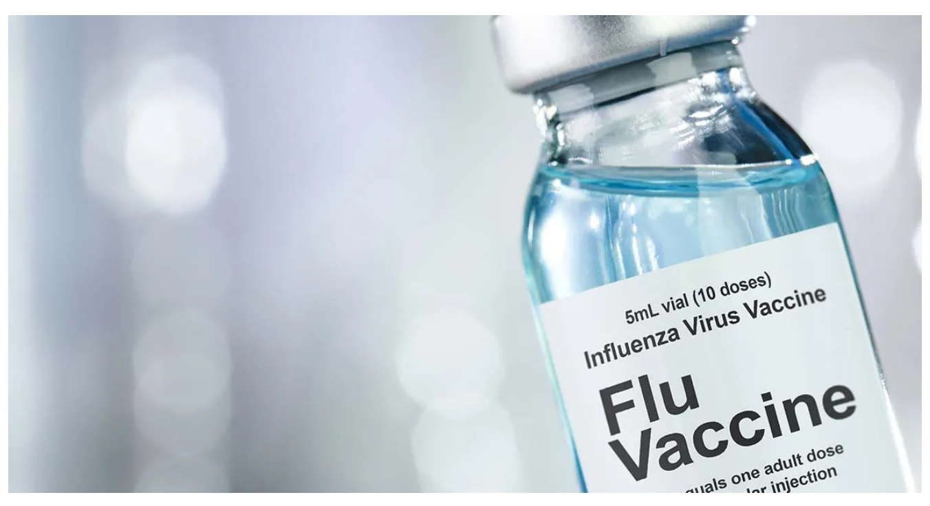
They've been hiding the efficacy data for the flu vaccine for more than 60 years. I wonder why?