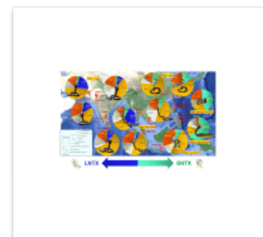
Figure 3 Snake venom proteomes of selected...