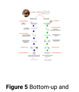
top-down proteomics in...