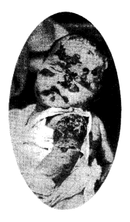
Mona Stevenson vaccinated for smallpox shortly after the turn of the century. Vaccinated when five weeks old. Photograph taken five weeks later. Death from "Generalized Vaccinia."