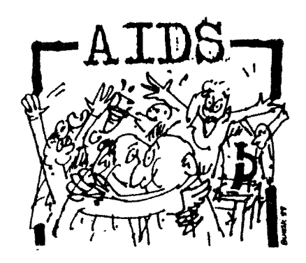
Explosion of enthusiasm in a research laboratory at the discovery of a new funding

The troops sent to the Persian Gulf received not only the standard immunosuppressive shots given by the military, but also a new experimental "biological warfare" vaccine ( Orange County Register , January 4, 1991, page A26, by Gina Kolata of the New York Times ). The article, "Troops in Persian Gulf to get Experimental Botulism Vaccine," states, "On Dec. 21